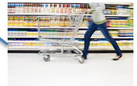
The Quick Shopper 48%