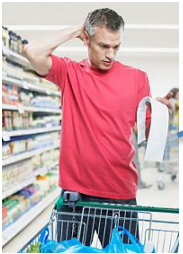
The Bargain Hunter 18%