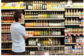
The Browser 6%